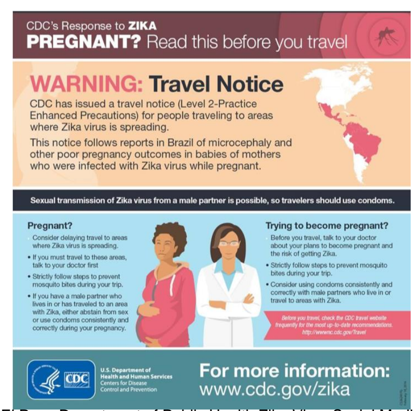
City of El Paso Department of Public Health Zika Virus Social Media Kit - 5